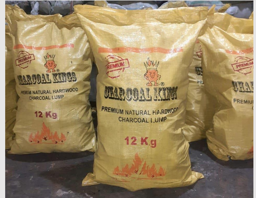
20/12kg PP w/plastic inner lining (Water resistant)