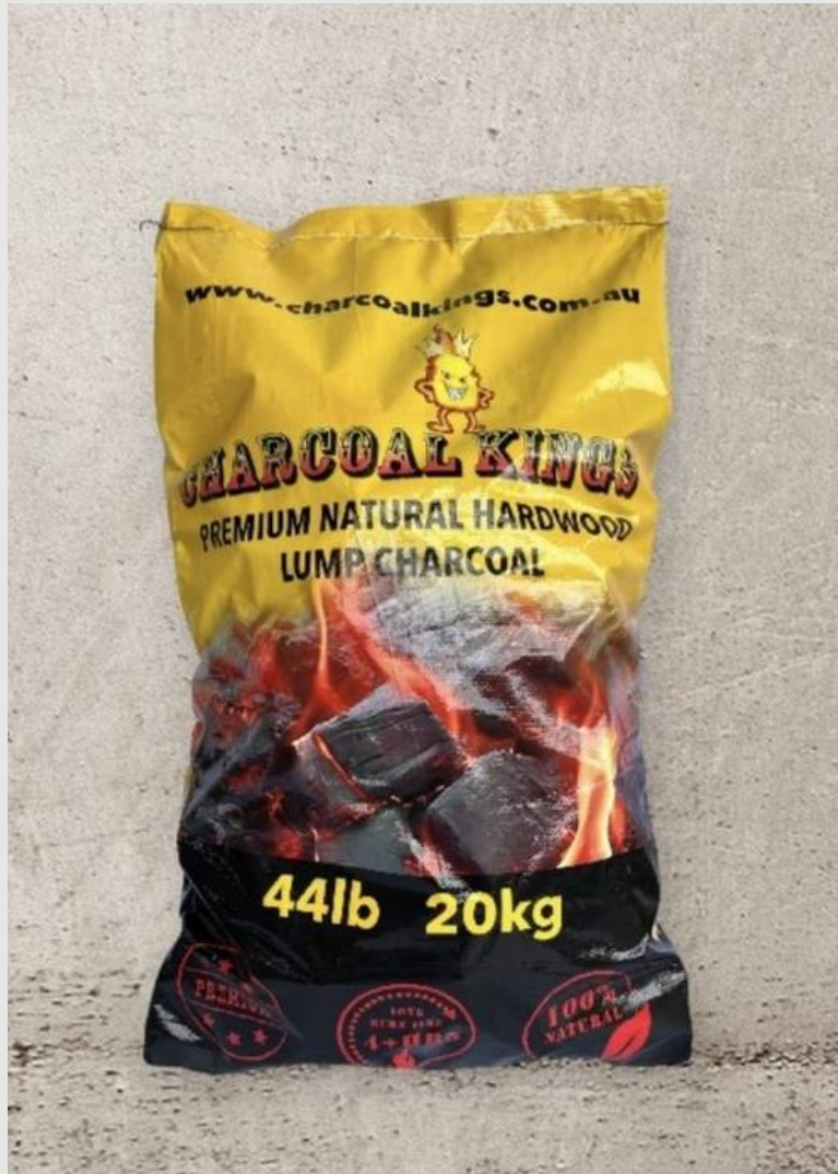
20kg BOPP Bag (Dust & Waterproof)